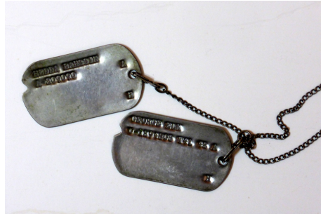
(Continued from page 1)

Community Arts Center 220 West Fourth Street